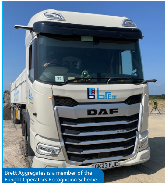
Brett Aggregates is a member of the Freight Operators Recognition Scheme.

We had a Freight Operators Recognition Scheme (FORS) audit in May 2023 for our Bronze accreditation. This accreditation lasts for a further two years. The business is currently both FORS Bronze and Silver accredited.