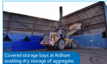
Covered storage bays at Ridham enabling dry storage of aggregate.

We have recently installed covered storage bays at Ridham, enabling the dry storage of aggregate. This will lead to energy savings since asphalt plants consume significantly less energy when heating dry aggregate for asphalt production.