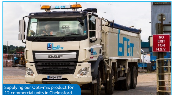
Supplying our Opti-mix product for 12 commercial units in Chelmsford.

In addition to the supply of recycled material, Brett Aggregates has also removed over 680 loads of topsoil from the project, which has been taken back to Shrublands for recycling.