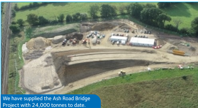
We have supplied the Ash Road Bridge Project with 24,000 tonnes to date.

The construction project will see vehicles re-routed across the new bridge and the level crossing permanently closed.