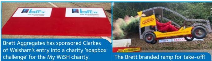
Brett Aggregates has sponsored Clarkes of Walsham's entry into a charity 'soapbox challenge' for the My WiSH charity.

Brett Aggregates has sponsored Clarkes of Walsham Ltd. in the My WiSH Charity Soapbox Challenge. The challenge involves entrants creating their own vehicles, powered by nothing more than gravity and leg strength as they face a downhill descent. The charity event was held in support of the West Suffolk NHS Foundation Trust to further enhance the care of patients throughout West Suffolk. Over £1,700 was raised by Clarkes of Walsham as they took home the 'Fastest Soapbox' and, most importantly, 'Best Fundraiser' trophies.