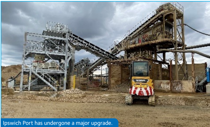
Ipswich Port has undergone a major upgrade.

The marine aggregate plant at Ipswich Port has undergone a major upgrade. After a record breaking 2022, we have invested in a new sand plant and screen – both extending capacity – to serve the local market. The team on site worked hard to build up stockpiles ahead of the refit to ensure we maintained delivery to Brett Concrete and the local customers.