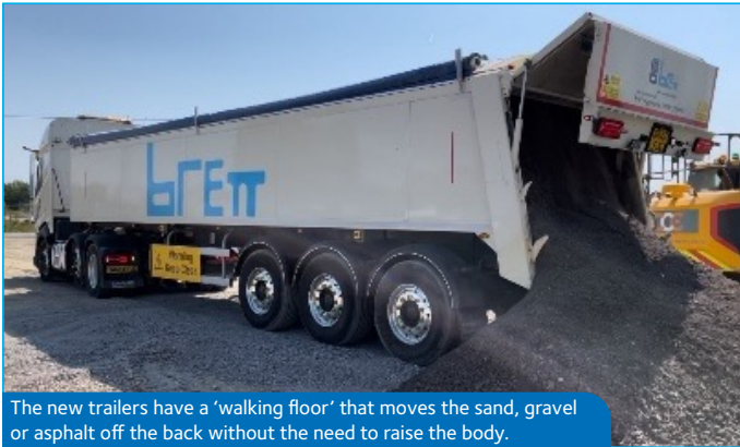
The new trailers have a 'walking floor' that moves the sand, gravel or asphalt off the back without the need to raise the body.

We have taken delivery of four 'non-tipping trailers' - these are articulated vehicles carrying up to 28 tonnes and featuring a 'walking floor' that moves sand, gravel or asphalt off the back without the need to raise the body. These vehicles are safer, can access areas with height restrictions and are quieter when travelling empty.