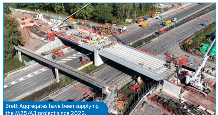
Brett Aggregates have been supplying the M25/A3 project since 2022.

During the project, the transport team have held various inductions for the drivers including an upcoming safety talk attended by Balfour Beatty. This has been the first major project where "what.three.words" has been used for all the different locations instead of postcodes.