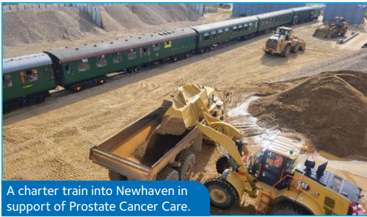
A charter train into Newhaven in support of Prostate Cancer Care.