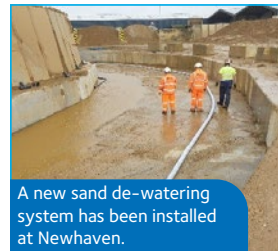
A new sand de-watering system has been installed at Newhaven.

We have completed a project to install a new sand de-watering system at Newhaven. This recovers water from the sand stockpiles via a network of buried suction pipes. The water is then reused in the aggregates washing process, reducing mains water usage.