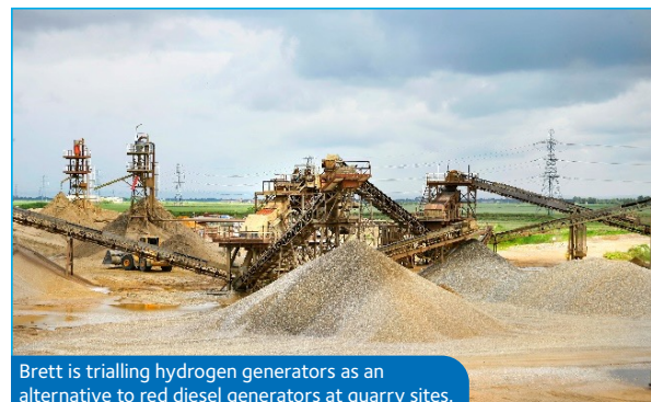
Brett is trialling hydrogen generators as an alternative to red diesel generators at quarry sites.

Brett is partnering with AFC Energy to trial hydrogen generators as an alternative to red diesel generators at quarry sites. The more sustainable "flex fuel" fuel cell systems provide clean electricity for on and off grid applications.