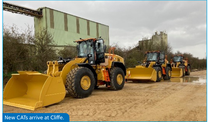
New CATs arrive at Cliffe.

We have confirmed contracts from CAT for 23 shovels and excavators for the year 2023-24. These are either extended contract or replacement vehicles. The new machines are fitted with the latest safety features and we will have the ability to monitor idling times and fuel usage.