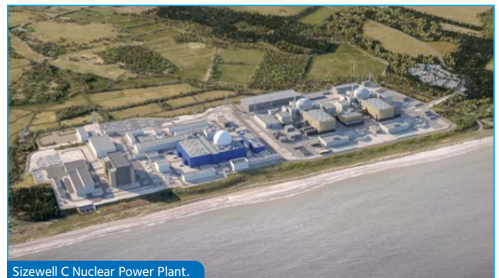
Sizewell C Nuclear Power Plant.

Since March this year we have been supplying granite from our site at Ipswich to the Sizewell C contract for enabling works.